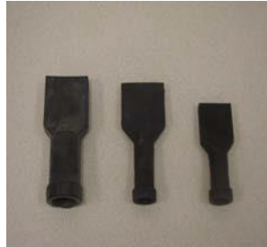
Flat rubber boots