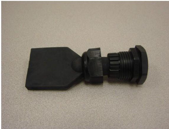
Flat cable boot positioned in round cable gland