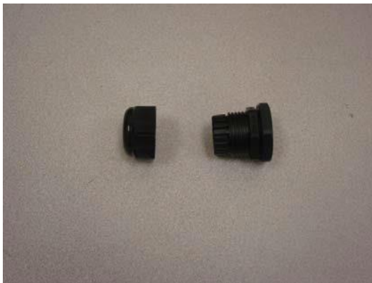
Nut and round cable gland