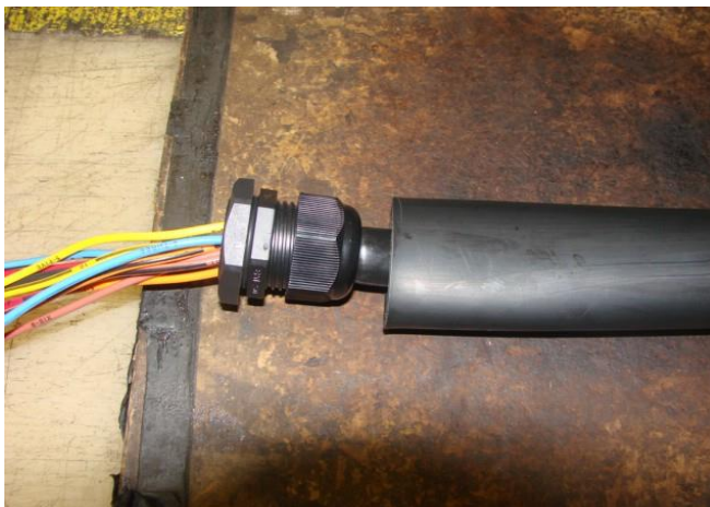
Shrink tube installed onto flat cable boot