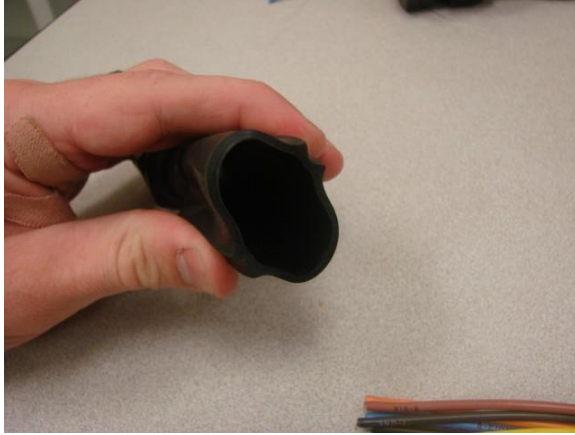
Squeeze flat end of boot to form a round opening