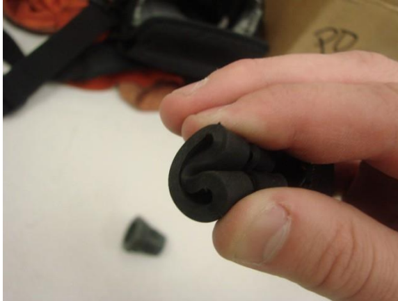
Fold round end of rubber boot