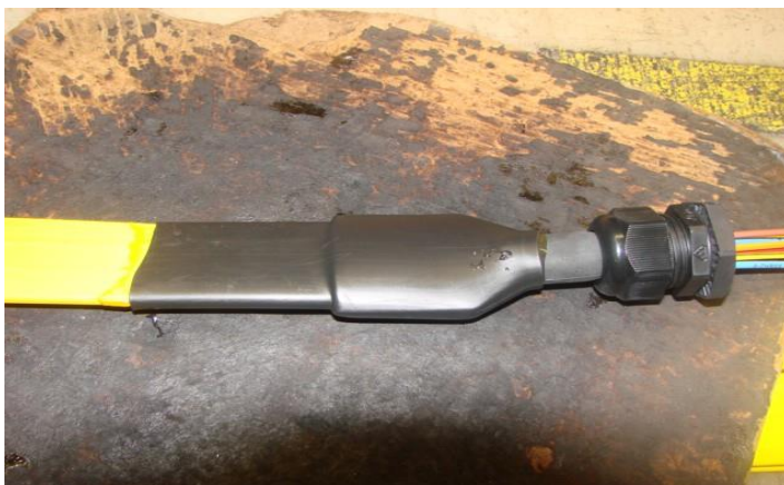
Completed flat cable adaptation

14.0. Apply heat to both sides of the shrink tube to ensure a proper seal. Note: It is normal that some adhesive will be present at the ends of the shrink tube after it has been heated.