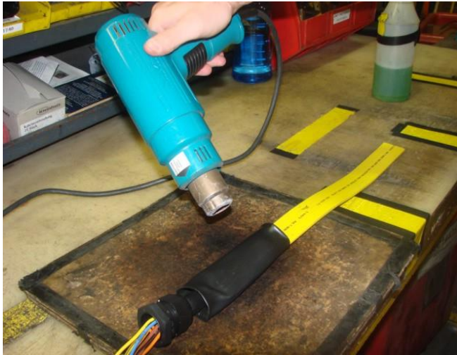
Applying heat to shrink tube

13.0. Use a heat gun to apply heat to the shrink tube until shape conforms and seals to boot.