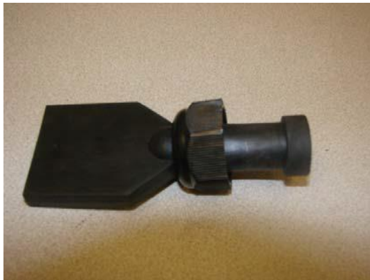
Flat cable boot with nut installed